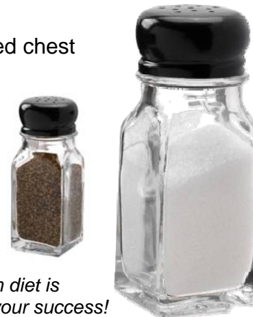
A low-sodium diet is essential to your success!